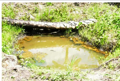
The present pool from which villagers collect their water for drinking, cooking and washing

Judith has priced the construction of a protected well, which