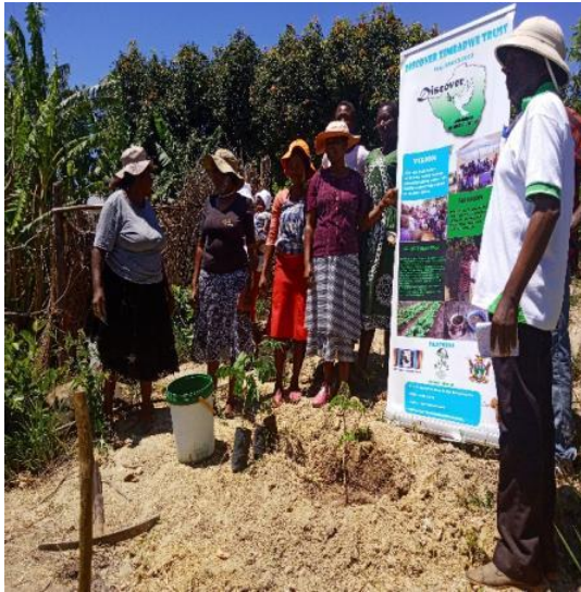
Fig 9. Community members of Chigodora Village

Tree planting community sensitization meeting was held at Chigodora under Nyamakamba of Chitakatira Area. Through this, the project encouraged the community to plant indigenous trees that promote environmental diversity as well as discouraging them from reckless cutting down of trees. The project managed to plant 40 indigenous trees in Chigodora area.