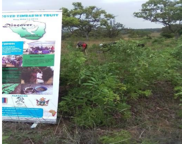
Fig 22 shows tree growing initiative in Marondera with project members taking a lead in pruning of young trees. For this effort, 4000 plants have been identified and incorporated into the tree growing caring project