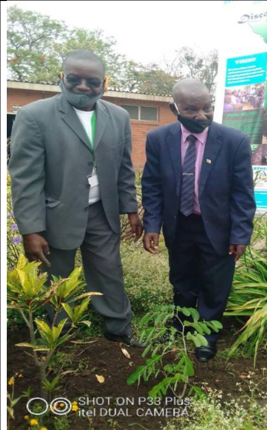
Fig: 8: DZT Director and Sakubva School Head posing for a photo after successfully planting a tree at Zamba Primary School.