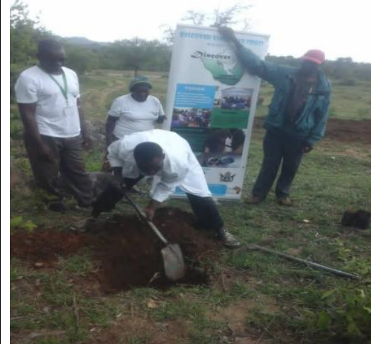
Fig 16. Tree planting in Marange