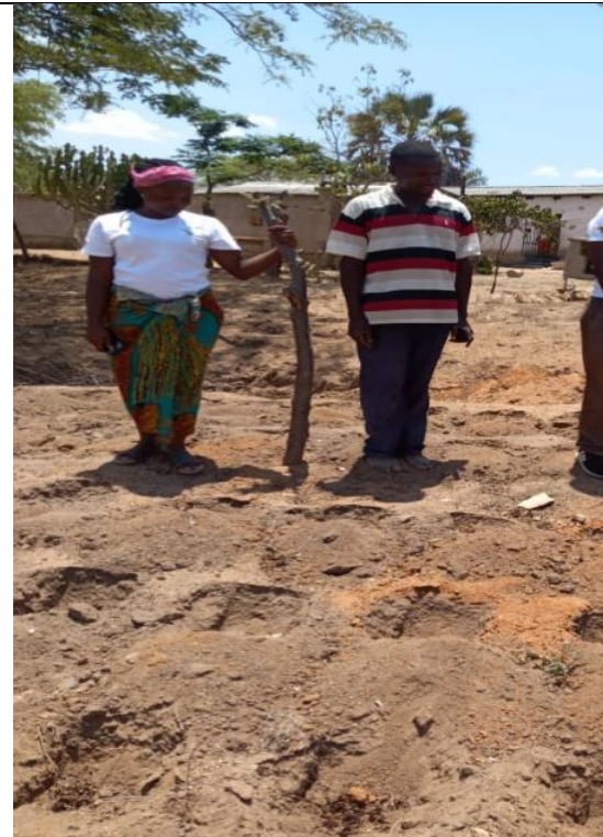
Fig 4: Maize planting holes prepared alongside tree planted stumps