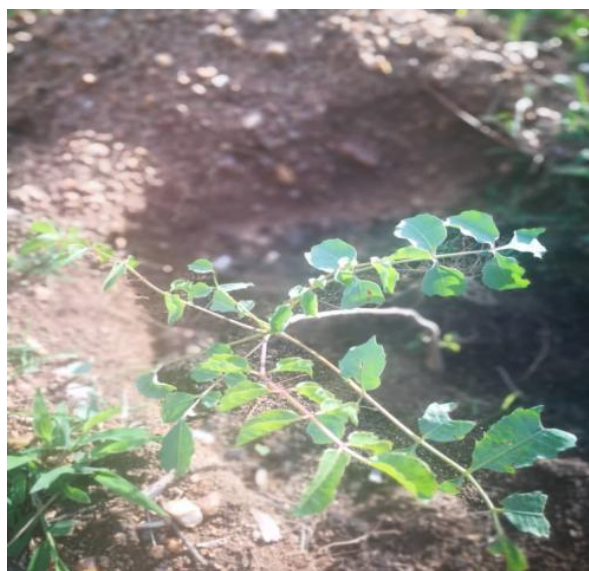
Fig 15. Amarula tree also known as Mupfura

demonstrating how to water newly planted tree