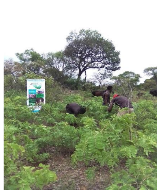
Fig 24. Green4Life tree growing promotion in Marondera West District. Such areas require fencing to ward-off the invasion of stray animals