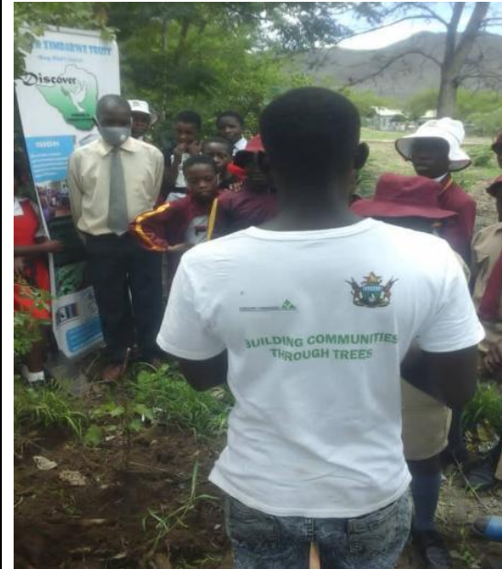
Fig 28: Tree growing at Sacred Heart is promising to be a good venture with about 300 tree plants identified. Above is a tree seedling that was identified, pruned and weeded to promote its growth.

maintained thereby increasing project confidence in planting more trees at the school.