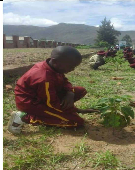
Fig 26. Showcasing of the kenyan croton trees that were planted early March 2020 at Sacred Heart Primary school in Mutare. The above picture shows some healthy plants properly