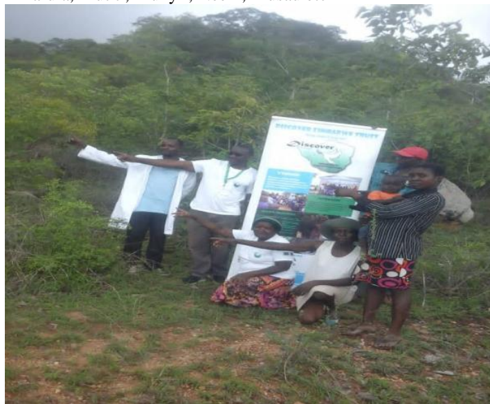
Fig 14. Green4LifeProject team conducted an awareness campaign on tree growing where each community member was encouraged to identify and take care of at least 50 trees annually

Through the Green4LifeProject, Marange community has been actively involved in the tree planting and growing venture that resulted in 120 indigenous trees being planted with project members. Such trees include but not limited to Mutohwe, Amarula, Mutiti, Munyii, Neem, Musau etc