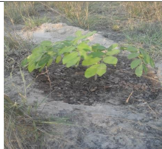
Fig 21 Shows mukamba tree planted at Plot 70 Marondera West District

Discover Zimbabwe takes tree growing and tree planting to Marondera where also the the Artemisia Annua plantation is located.