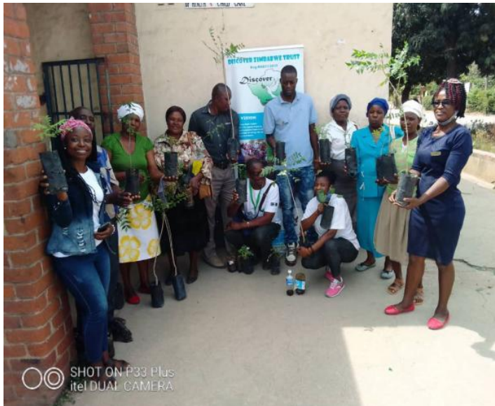
Fig 17. Each of the ZINPA member holding a tree in Mutare

ZINPA is an Association of Traditional Medical Practitioners of Herbalist, Traditional Healers and Faith Healers and Discover Zimbabwe is an affiliate member of ZINPA.