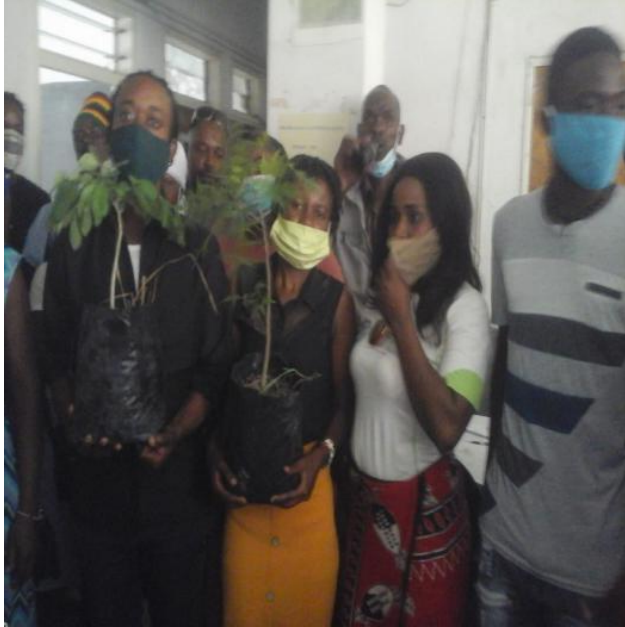
Fig 19. ZINPA members at ZINPA HQ in Harare happily displaying donated trees