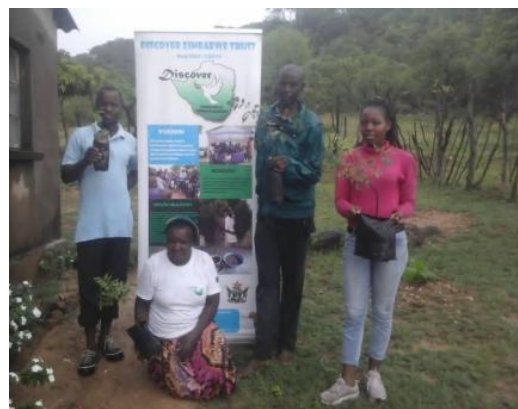
Fig 15. Each community member was given at least 15 trees and encouraged to take advantage of the onset rain season to plant the donated trees without delay