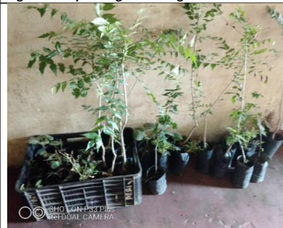
Fig 18. Some of the indigenous trees ready for distribution to ZINPA members by the Green4LifeProject