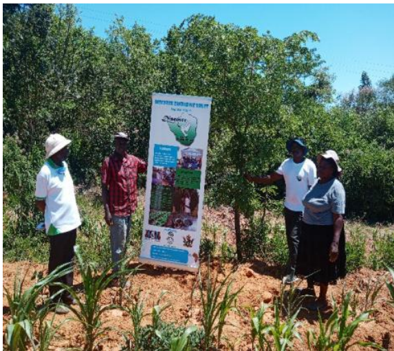
Fig 11. Green4Life Project promoting tree growing