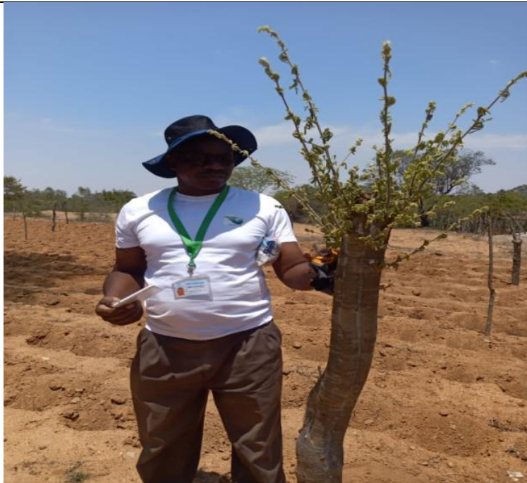
Fig 3. Tree growing at Chigonda in Marange. This method of planting tree stumps allows communities to do intercropping with crops like maize while the tree stump is establishing its roots.