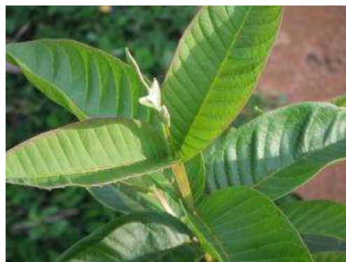
Psidium guajava - guava

weed: Wash one handful of the above ground parts. Boil in 1 litre of water for 2 to 3 minutes in a pot with a lid, then allow