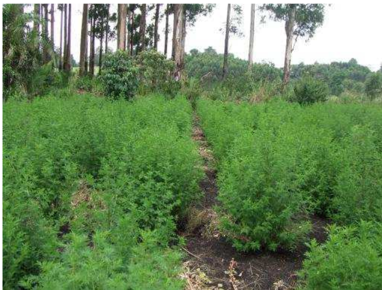
A plantation of Artemisia annua plants at Tooro Botanical Gardens, Fort Portal, Uganda.