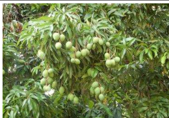
Mangifera indica - mango

For a very strong treatment, take a handful of asthma weed, a handful of guava leaves and a handful of fresh young mango leaves. Boil in one litre of water for 3 minutes, allow to stand for 30 minutes, filter and drink 1 litre in the course of the day. Continue this treatment for three or four days after all symptoms have disappeared.