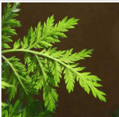
A single leaf of Artemisia annua

Pour boiling water over a heaped teaspoonful of dried artemisia powder in a 250ml cup, let it stand for 10 minutes and then drink. Repeat 4 times a day and continue for 5 days, even after the symptoms disappear. Also drink 2 litres of lemon grass tea each day.