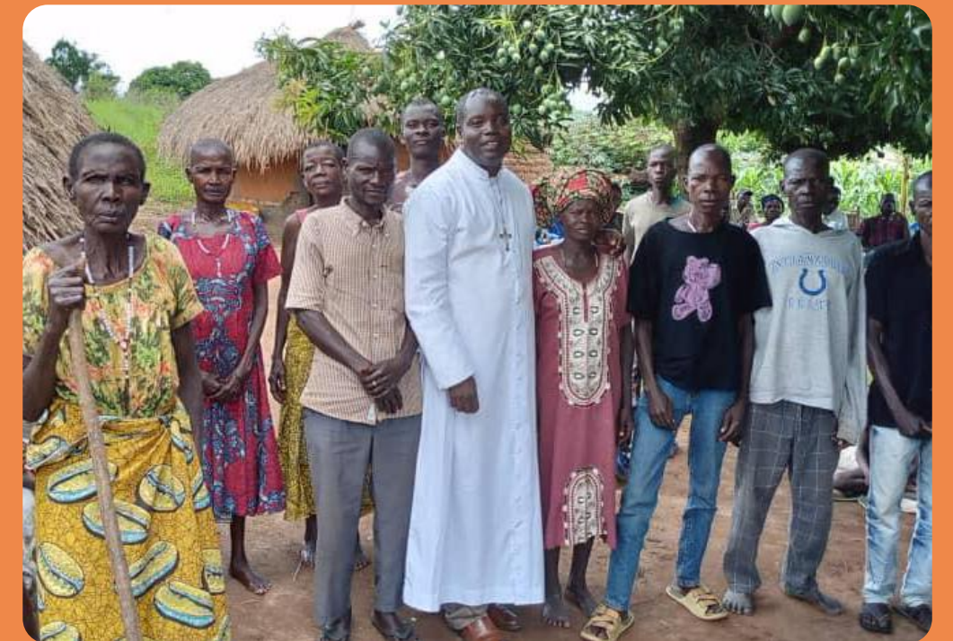
Come together photo with the two clans after a successful reconciliation meeting.

We all need each other in one way or another. Staying in together in peace is what God demonstrates to us in His Trinitarian formular of Father, Son and Holy Spirit. You can only smile or laugh when your friend tickles you. We also need peace with our environment. Working together means joy for us all