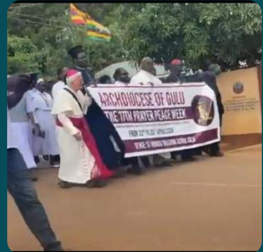
Bishops of Gulu Archdiocese marching for peace during the Provincial Peace week at Lira Diocese.

Religious practices like using Public Address Systems to preach with very loud sounds, slaughtering of animals during public celebrations which Moslems believe must be done only by a Moslem, and marriage between Christians and Moslems have also caused conflicts in the communities