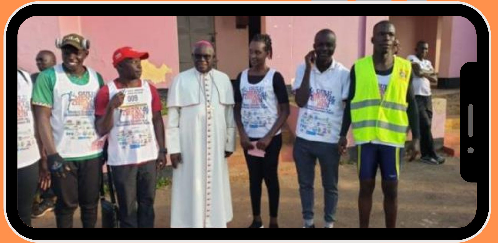
Archbishop John Baptist Odama, the Mediator between the LRA and the government of Uganda.

This insurgency in northern Uganda raised serious concerns in the area and a much-needed solution was sought from different angles.