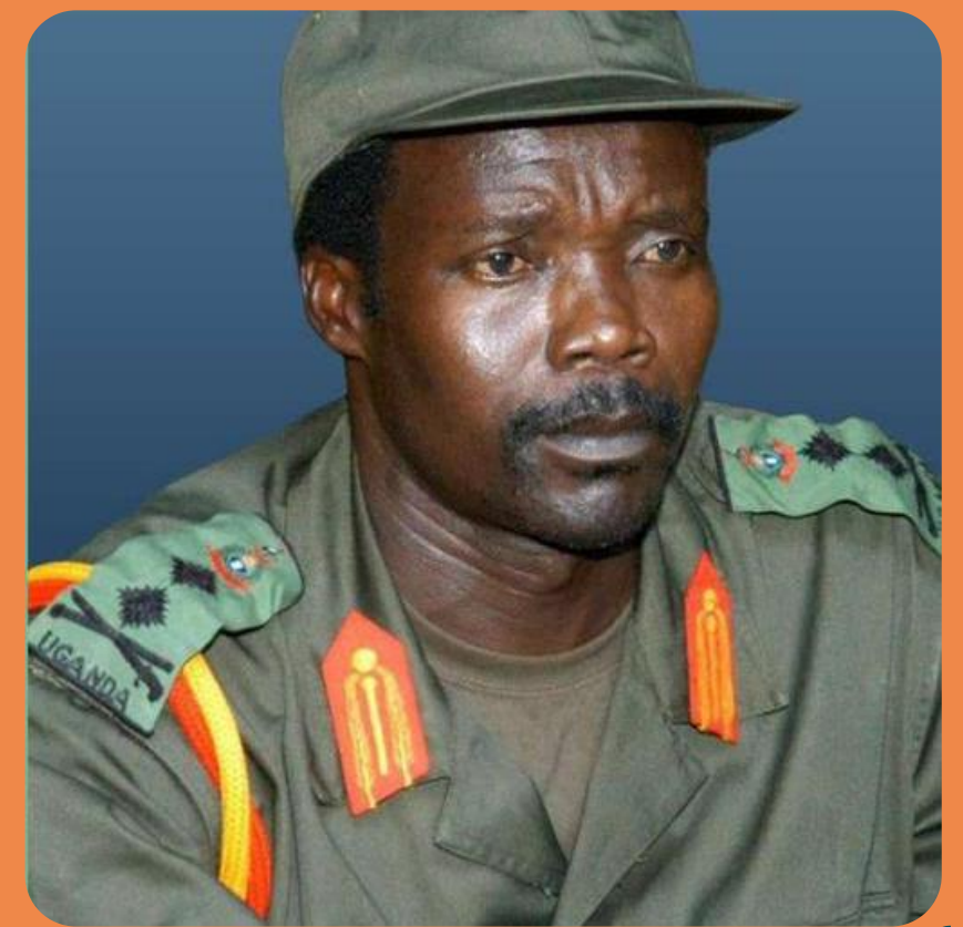
Joseph Kony the leader of LRA.

Northern Uganda as it is known suffered a very long period of insecurity under Lord's Resistance Army led by Joseph Kony. This civil war caused a lot of untold suffering in the districts of Gulu, Pader, Lira, Soroti, Kumi, Nebbi, Arua, Adjumani, Moyo and the neighboring South Sudan.