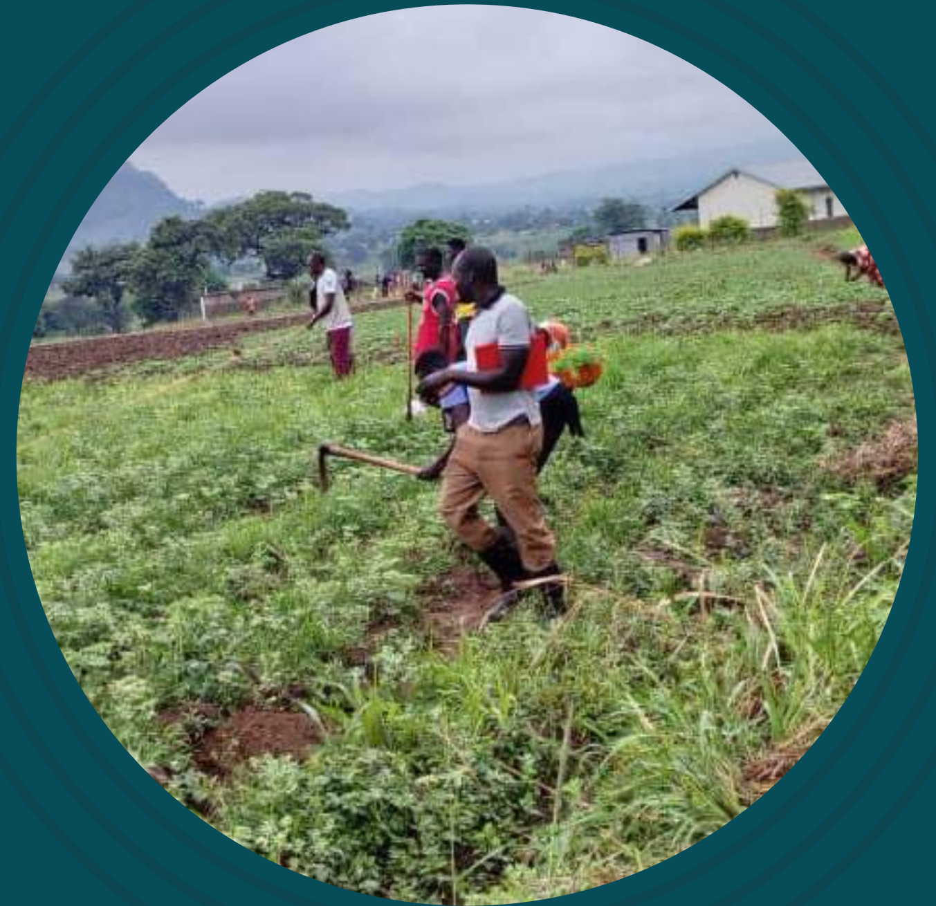
Joint project of farming. Osoko and Aliba clans growing Groundnuts together.