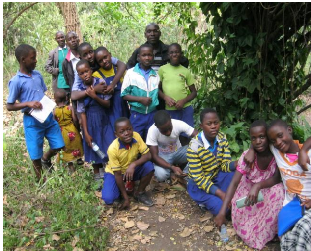
A photo with fellow pupils from other schools together for a training.