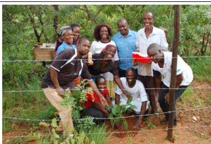
The bee-keepers proudly showing off the last of 150 seedlings planted in a natural, protected woodland

The group was clearly highly motivated. Their honey and honey wine were delicious!