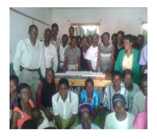
We also teach prisoners