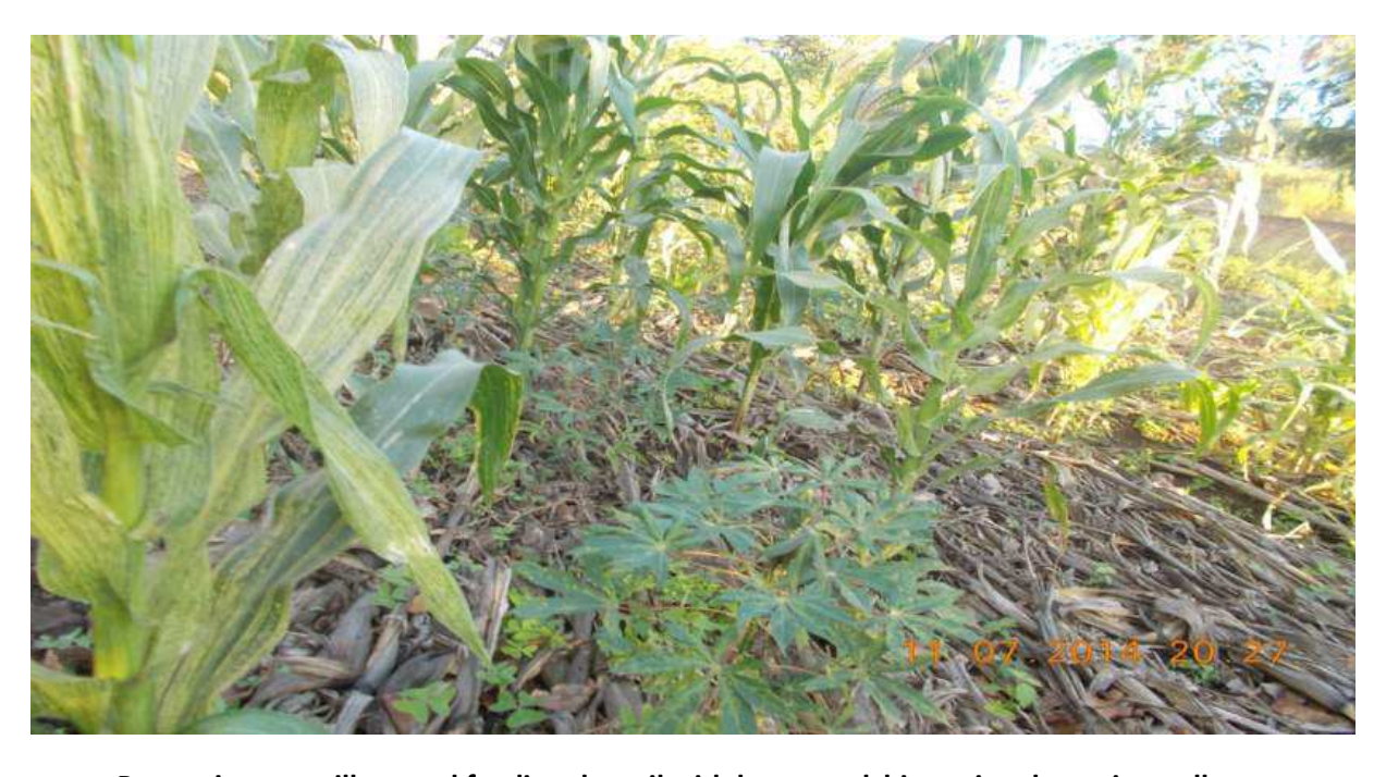
Promoting zero tillage and feeding the soil with heavy mulching using the maize stalk