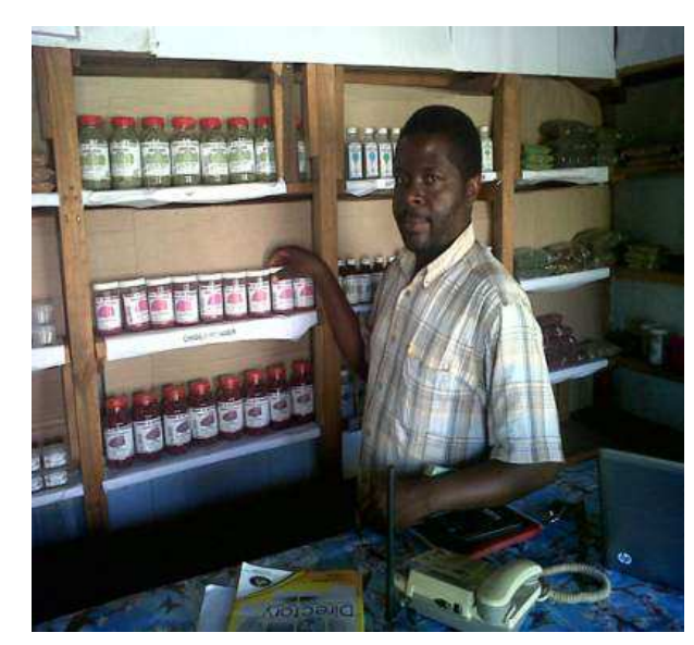
This building serves both as an office and as a shop for dried herbs and vegetables