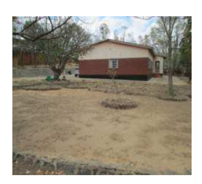
Before the training