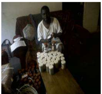
How to increase production