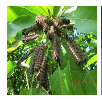
Pests attack our plants