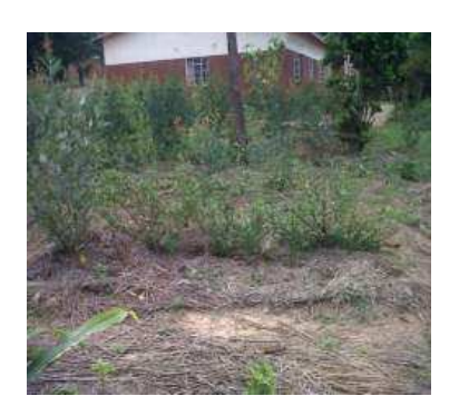
Three months later