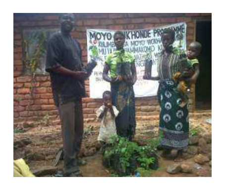
Moyo Mukhonde Initiative