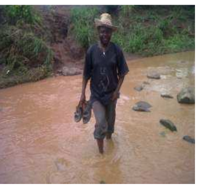
River flooding during rains